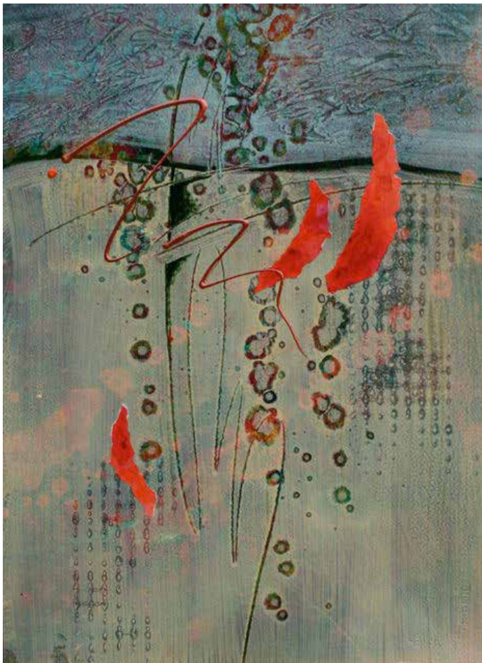
Interlude by Ellie Prakken