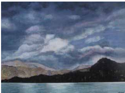
Study in Strata #11