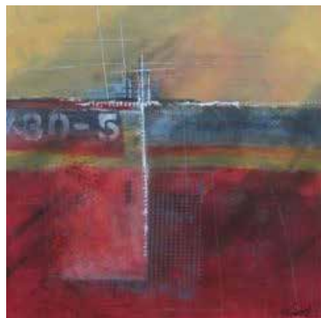
What Lies Beneath