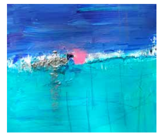
Red Storm Rising by Kris Kelly

Concert begins at 6:00 pm Gallery hours: 5:30 - 8:00 pm 362 State Street, Albany