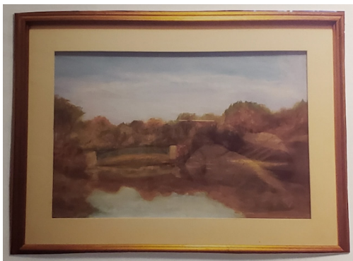
The Bridge at Washington Park