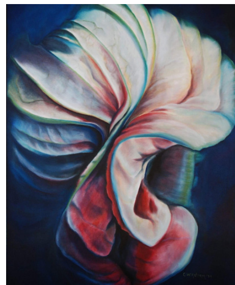
Pumpkin Blossom 1