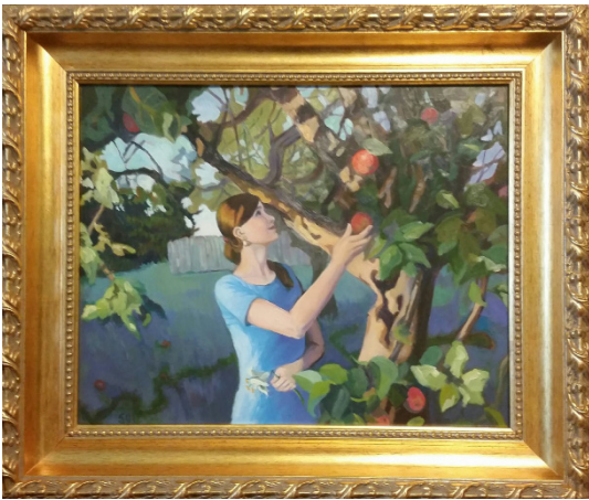
Choices in the Garden

has four paintings at the Art Associates Gallery on Railroad Ave., Albany through the end of November. Choices in the Garden is one of them.