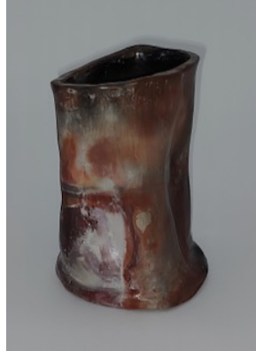
Pit Fired Jar