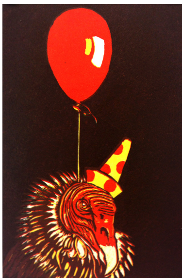
Vulture Clown ~ Linoleum print