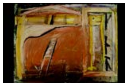
Left: "Special Place"