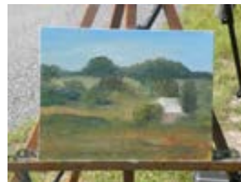
Blocking in at Plein Aire session with Jim Coe

Contact info: 518-489-1882 or TShock1882@aol.com