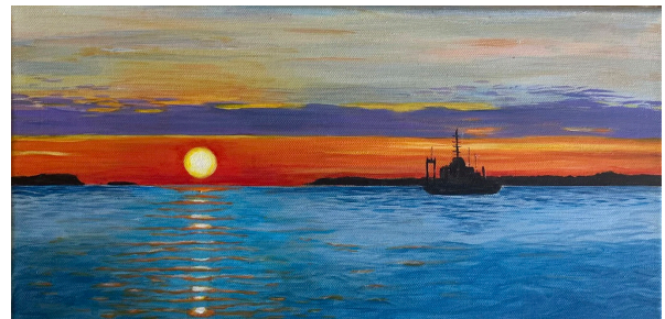
Sunset at 1000 Islands, NY