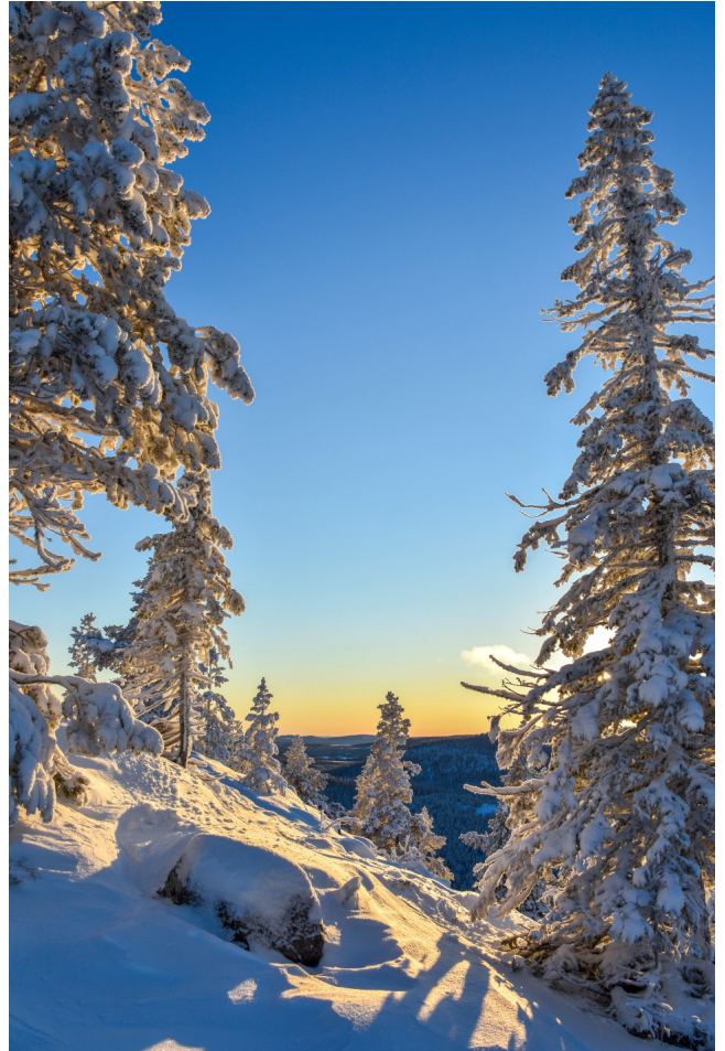
New Winter Art Challenge

The goal of the Bethlehem Art Association is to increase opportunities for the public to see work done by local artists.