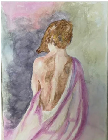
After the Bath

Karen Zimmers' painting "After the Bath" will be shown in the Rockland Arts Festival January 26-February 9.