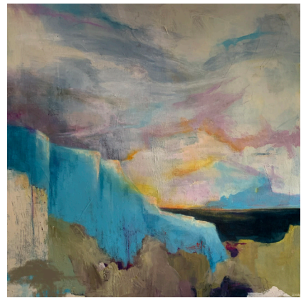
The Scottish Sea