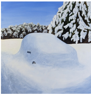
Wonderful Winter Morning