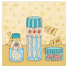
Alien Pets Still Life