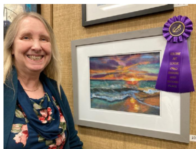
Seascape Drama: Sunset