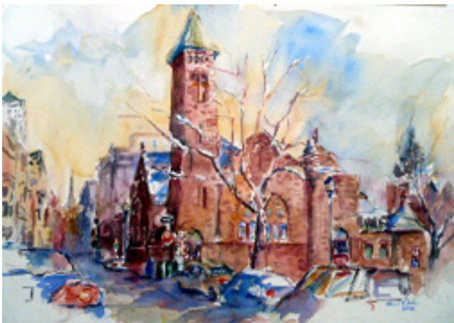
First Presbyterian Church

Kevin Kuhne will be doing a one-night "Pop-up" show for Albany First Friday, 5:30 - 8:00 pm, December 1, 2023 at the First Presbyterian Church of Albany, 362 State Street, Albany, NY 12210 This will be a solo show featuring Kevin's old and new work, including watercolors, etchings, and constructions.