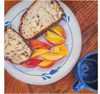
Warm Buttered Toast