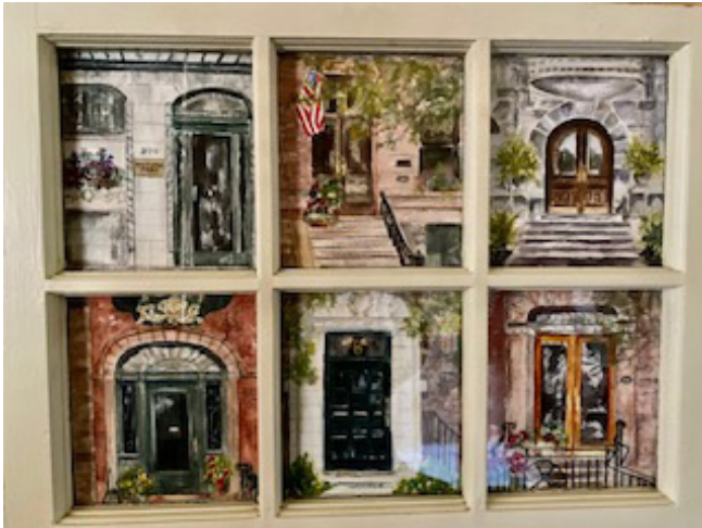
Doorways on the Park