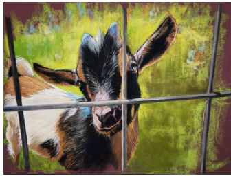
Give Me the Bleat Boys and Free My Soul