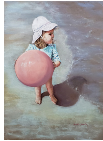
A Peach on the Beach Pastel Society of Alaska