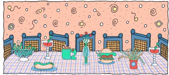
Alien Food Sampler