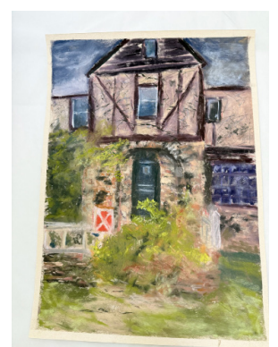
Please Save Me