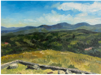
View From the Schoolhouse