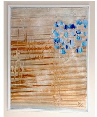
In the Blues