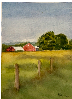
Barn on Meads Lane